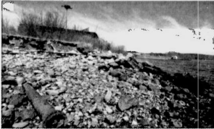
An osprey nest sits near mud flats and General Alum in Searsport.