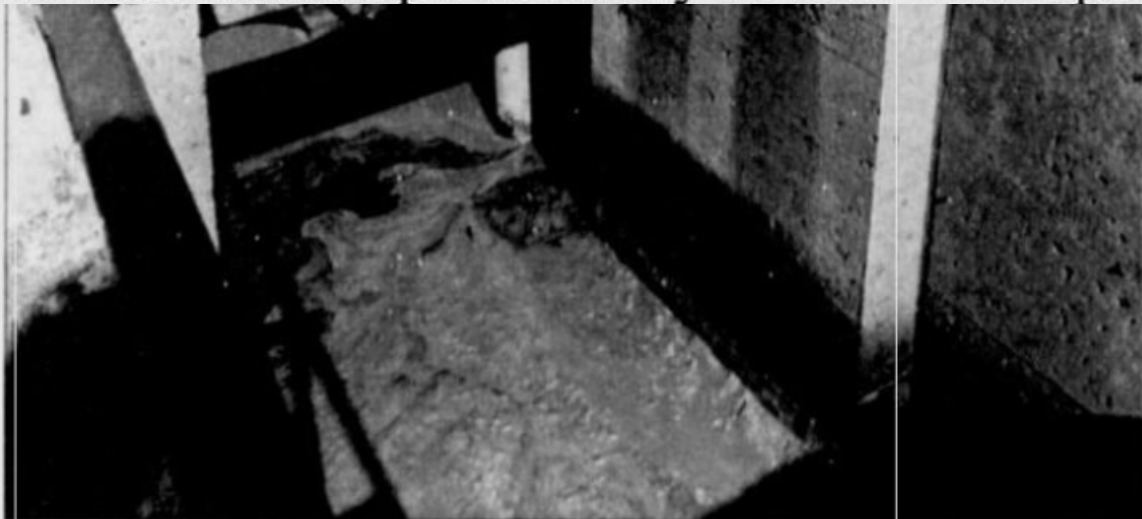
Workers from Clean Harbors Environmental Services Inc. use machinery to suck up fuel-laden muck from a weir at General Alum and Chemical Corp. in Searsport, which owns the concrete catch basin containing the gunk. The operation was overseen by the U.S. Coast Guard, which required the cleanup.

Substance at Searsport site may be from 1989 spill