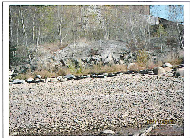
Close look at thinly vegetated location. Note white line on shore and old cribwork above