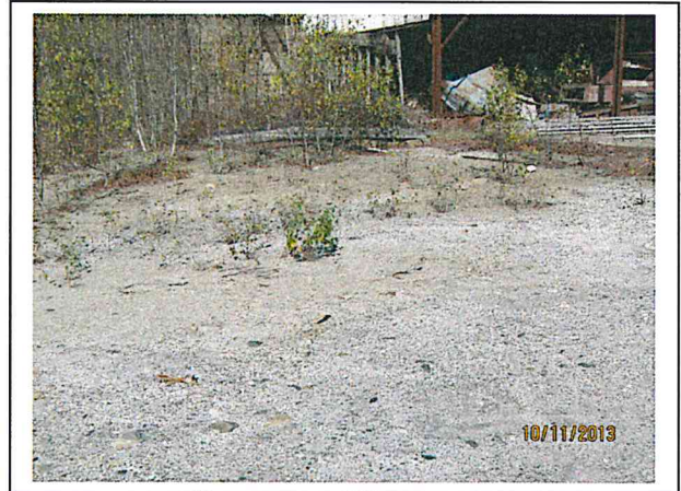
Adjacent to former sulfuric acid plant; small amount of sulfur chunks on surface, and some yellow staining. It looks as though surface water runoff from this area could go over the bank toward the area where we saw yellow discoloration in the intertidal area.