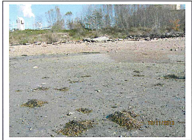
Southeast of previous; note bank and yellow & orange zones in intertidal area