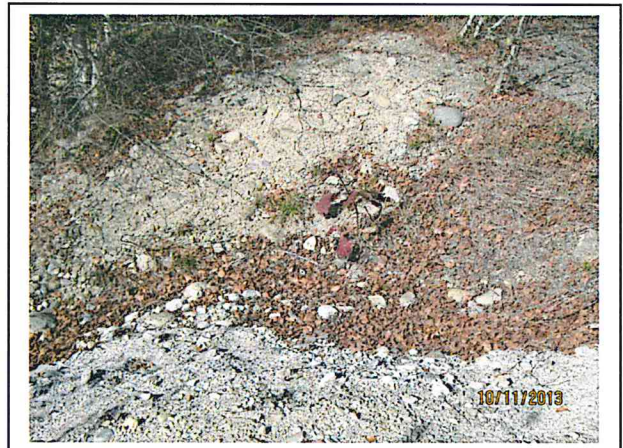
Slightly gullied area at edge of previous photo-some yellowish discoloration.