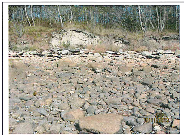
Slumped bank southeast of previous.