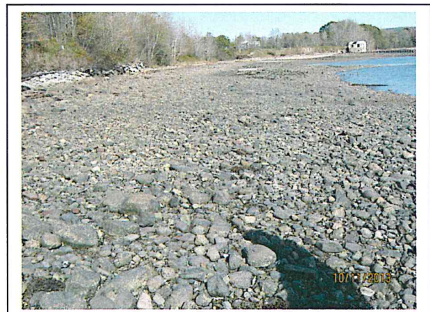
Shoreline east of point; old pumphouse at upper right.