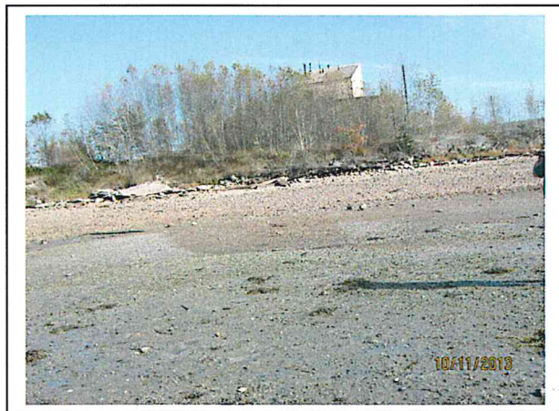
More southeasterly; sulfuric acid plant visible through Trees. Thinly vegetated area at upper right.