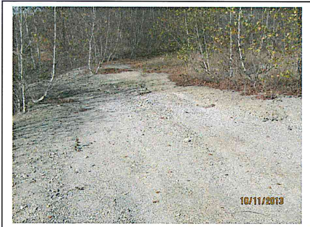
Between sulfuric acid plant and shoreline to west.