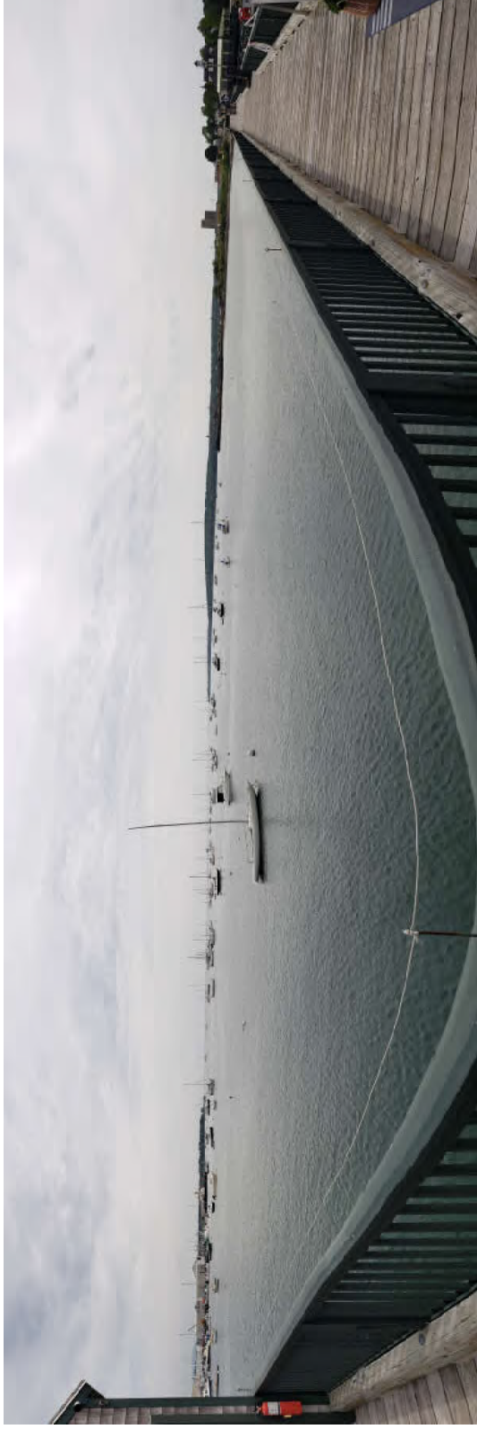
Photo 10: Panoramic Photo looking East from the existing pier (6-22-21)