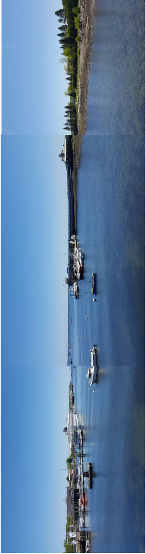
Photo 5, 6, and 7: Boardwalk toward marina expansion area (Public Landing to Gazebo) (6-12-19)