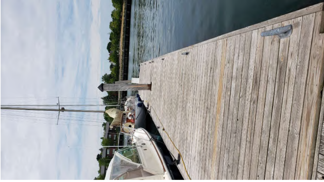
Photo 15 Looking west at existing floats